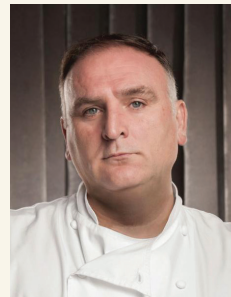
José Andrés (1969 – )

eventually shut down, she continued advocating for the fair treatment of women and Mexican Americans.