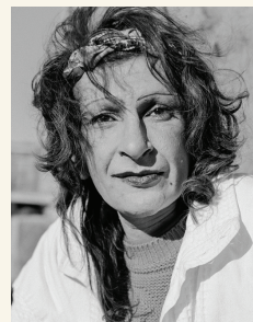
Sylvia Rivera (1951 – 2002)

José Andrés grew up in Spain and came to the U.S. in 1991. After the earthquake in Haiti in 2010, he formed the World Central Kitchen (WCK) to provide hot meals to those affected by natural disasters. He served 3.5 million meals to residents in Puerto Rico after Hurricane Maria, and also fed furloughed workers during the month-long government shutdown in 2019.