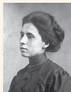
Jovita Idár (1885 – 1946)

National Hispanic Heritage Month traditionally honors the culture and contributions of both Latino and Hispanic Americans. The history and accomplishments of these groups in the shaping of the country are celebrated. Here are some notable Hispanics you should know about: